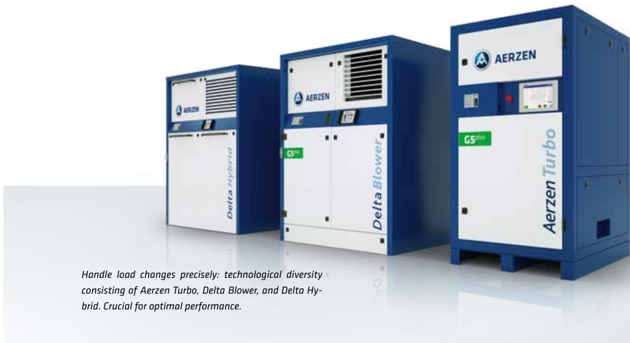
Handle load changes precisely: technological diversity consisting of Aerzen Turbo, Delta Blower, and Delta Hybrid. Crucial for optimal performance.

Today, real efficiency means adapting one's choice in blower technology to match precisely the load profiles in wastewater treatment plants. That's because every plant is different and has its own requirements. With a customised Performance 3 design, you utilise the advantages of every machine technology. That means maximum energy savings with an optimal control range and minimal investment volumes. Depending on the plant, process optimisation can pay for itself within two years. Consisting of Blower, Hybrid, and Turbo, you are guaranteed to find an efficient and appropriate solution in AERZEN's Performance 3 product portfolio.