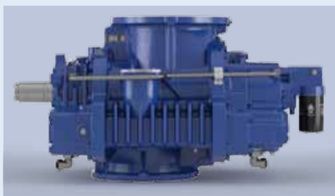
The new machine type D98 V

With the new special machine Delta Hybrid D 98 V, the range of maximum possible negative pressure of the AERZEN rotary lobe compressor series has now been expanded further, down to -950 mbar, which is close to the vacuum range. This improved performance has been made possible through an ingenious approach for the supply of cooling air via additional pre-inlet channels. The new machine type offers clear advantages with its increased negative pressure capabilities - transport of heavier materials, over longer distances and/or with higher speed. The result is that, whatever the circumstances, the efficiency of loading and unloading increases. The D 98 V, which can generate overpressures of up to 1,500 mbar, can operate via both mobile or stationary platforms and supplies a maximum volume flow