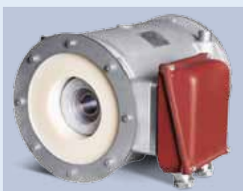
New hermetically sealed motor for AERZEN vacuum blowers

AERZEN vacuum blowers series HM for neutral gases are available in nine sizes. Due to the standard water cooling they are appropriate for application under clean room conditions. The application of a frequency converter makes a high control range (1:5) possible, and therefore the use of smaller blower sizes. Thanks to different motor variants for cyclical and continuous operations, an individual solution can always be found, even for special applications.