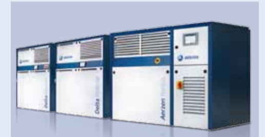
AERZEN Turbo Blower, Delta Blower and Delta Hybrid offer Performance 3 : highest levels of operational safety, reliability and efficiency

In order to engineer suitable solutions for each application, different technologies are used in the wastewater industry. A combination of these high-performance technologies is ideal for achieving maximum energy efficiency they must be perfectly adapted to each other and able to handle changing requirements. With Performance 3 AERZEN is able to provide optimal solutions, all from one source: For example for production of the base load requirement AERZEN Turbo Blowers ; for production of peak or low load requirements, AERZEN Positive Displacement Blowers of series Delta Blower as well as AERZEN Rotary Lobe Compressors of series Delta Hybrid .