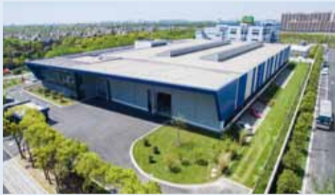
The new factory site of Aerzen Int. Trading

The production facility of Aerzen Int. Trading in Shanghai now has a new factory layout, thus positioning itself for further growth in the assembly construction sector. At the end of 2016, as part of the replanning process for the entire production division, various layout variants, assembly and logistics processes were designed and assessed. The factory structure which has been developed combines site-specific conditions and experiences, as well as proven AERZEN processes and Lean criteria - and the subject of Feng Shui was carefully considered by the planning teams in China and the parent company. The new factory layout has been designed so that production can be adjusted flexibly in several stages to match sales growth and a modified product portfolio.