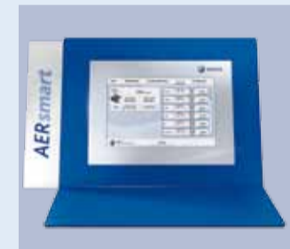
AERsmart makes most efficient operation of wastewater treatment plants possible.

AERsmart also convinces because it operates fully in line with new guidelines from the DWA (German Association for Water Economy, Waste Water and Waste) for the energy efficiency and energy analysis of wastewater treatment plants. And besides, as an intelligent interface, it is already pointing the way to Water 4.0.