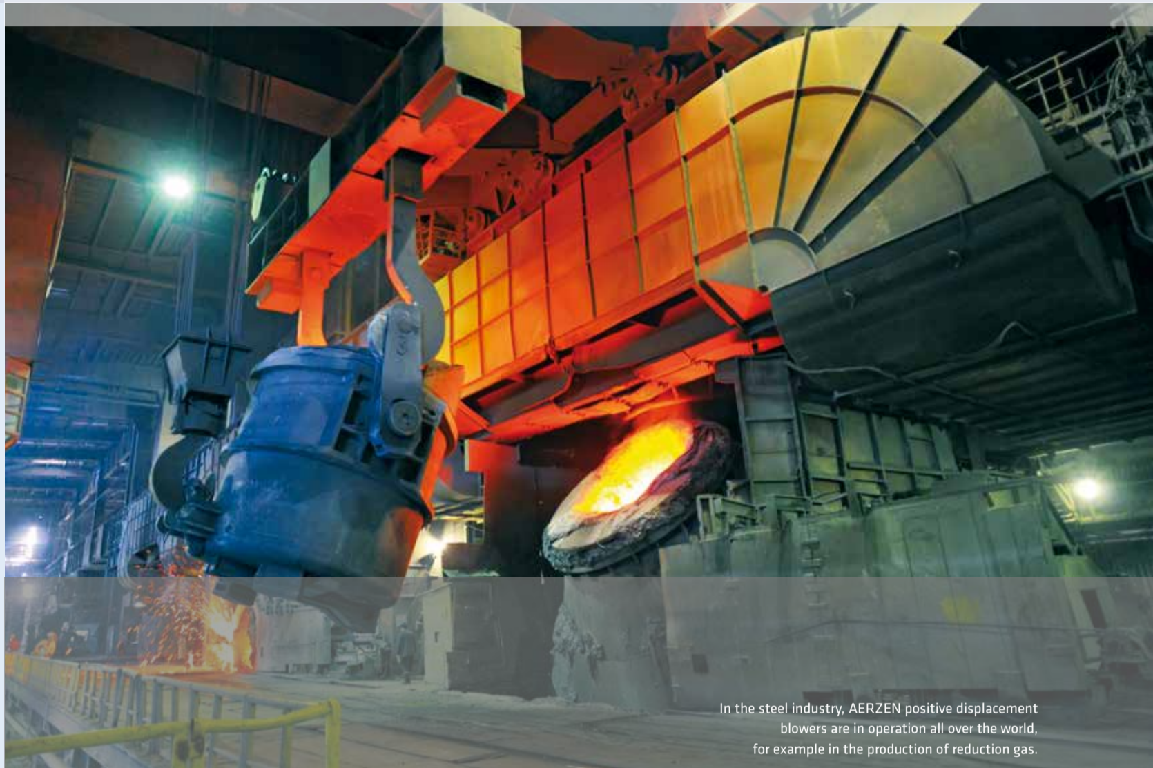
In the steel industry, AERZEN positive displacement blowers are in operation all over the world, for example in the production of reduction gas.