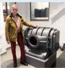
AERZEN blower at the 'Stilwerk' Design centre in Hamburg

While shopping in Hamburg one of our colleagues discovered an AERZEN product in an unusual place: in the entrance area of the Stilwerk Design centre, in the middle of a café, an old AERZEN blower was exhibited. The GLa 14.18 blower, manufactured in the 1960s, had been running in a malt factory where it had been used in a silo plant.