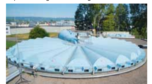
The wastewater treatment plant, located in Beggen, Luxembourg, is considered a model of high quality in respect of sewage water cleaning.

Today, the wastewater treatment plant in Beggen is an example of highly available plant technology, jointly developed by users and manufacturers. Against the background of maximal operational reliability, the design was characterised by a healthy level of power reserves. According to Luc Ley, the confidence in AERZEN is "very high" as no other planning office had been involved in the retrofitting.