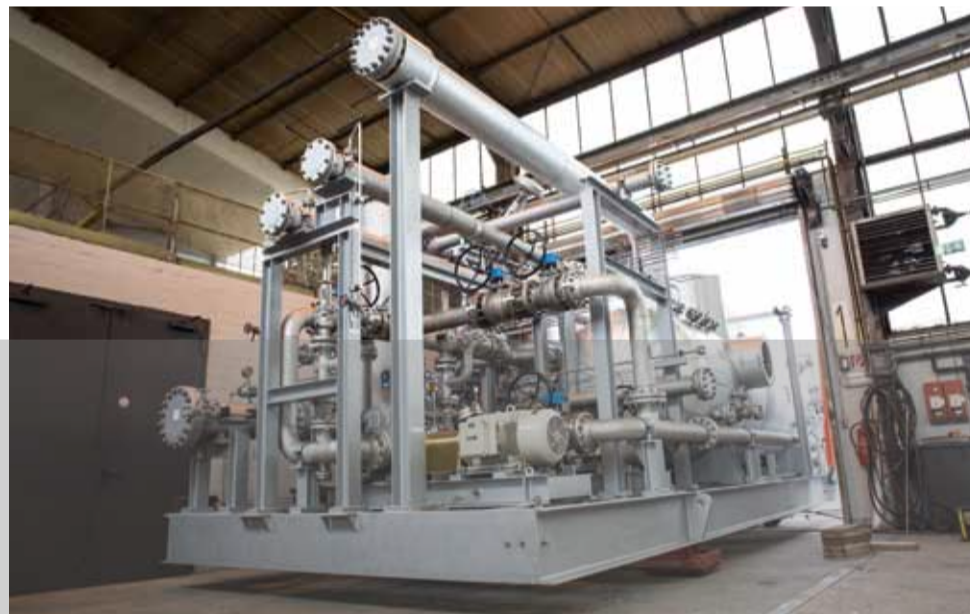
A module of the VMY 536M-unit for the "Jamnagar" oil refinery in India

AERZEN was given an order, by a big Indian concern, for the development of an extremely large VMY-unit for the "Jamnagar" oil refinery. For this huge project, enormous expenditure was necessary.