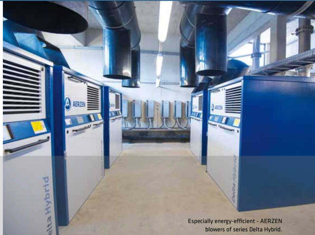
Especially energy-efficient - AERZEN blowers of series Delta Hybrid.

Delta Hybrid rotary lobe compressors made by AERZEN