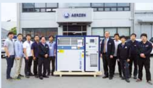
Aerzen Turbo Generation 5 - available in Asia with immediate effect.

The new series Generation 5 is characterised by improved fluid mechanics resulting in increased energy efficiency, reduced sound levels and less maintenance. Space-saving "side-by-side" installation is also possible.