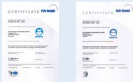
Emmerthaler Apparatebau GmbH has successfully passed the recertification audit pursuant to ISO 9001 and BS OHSAS 18001.

Thanks to this recertification, and the already attained certifications such as ASME, TR/TS 032, DNV, China License and H/H1, customers will be provided with the best possible service with regard to planning, calculation and manufacturing of pressure equipment, with everything coming from a single source.