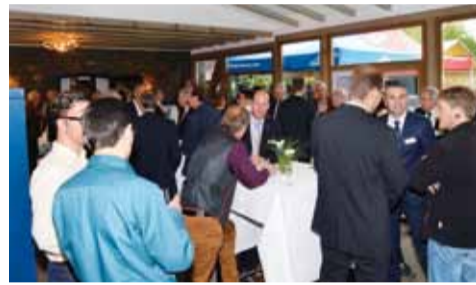
Together with loyal customers the sales office West celebrated its 50th anniversary.