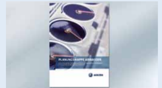
Planning folder waste water

You can order the new waste water folder free of charge using the attached order form.