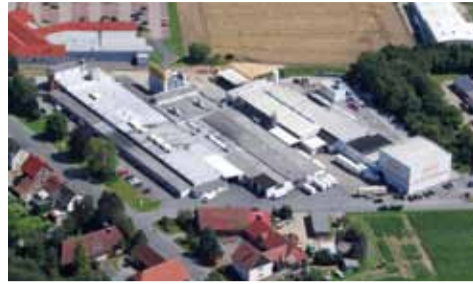
Aerial photo of the industrial bakery Aerzener Brot und Kuchen GmbH in Lower Saxony

With the E-Blower, AERZEN has been able to increase the efficiency by at least four percent through constructive optimisations - among other things by flow-optimised direction of the intake air in the acoustic hood and the filter silencer. Moreover, the patented intake cone minimises pressure losses as well as sound emissions. Also quickly wearing absorption material was not used in the E-Blower - an additional protection against contaminations of the downstream process system and thereby of the final product. The E-Blower has further advantages with respect to energy efficiency through its revised cooling concept. In this case, an optimally placed and electrically driven fan replaces the widely spread mechanically coupled acoustic hood fans. The independent operation enables control of the fan power, so that in partial load operation with low dissipated heat, the fan can be run at lower speed. Also, in order to achieve more effective cooling, the AERZEN units suck on the cool front side, in order to have a possibly higher Delta T compared with