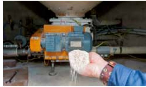
With compressed air the required raw materials reach the "bakery".

With the E-Blower, AERZEN has been able to increase the efficiency by at least four percent through constructive optimisations - among other things by flow-optimised direction of the intake air in the acoustic hood and the filter silencer. Moreover, the patented intake cone minimises pressure losses as well as sound emissions. Also quickly wearing absorption material was not used in the E-Blower - an additional protection against contaminations of the downstream process system and thereby of the final product. The E-Blower has further advantages with respect to energy efficiency through its revised cooling concept. In this case, an optimally placed and electrically driven fan replaces the widely spread mechanically coupled acoustic hood fans. The independent operation enables control of the fan power, so that in partial load operation with low dissipated heat, the fan can be run at lower speed. Also, in order to achieve more effective cooling, the AERZEN units suck on the cool front side, in order to have a possibly higher Delta T compared with