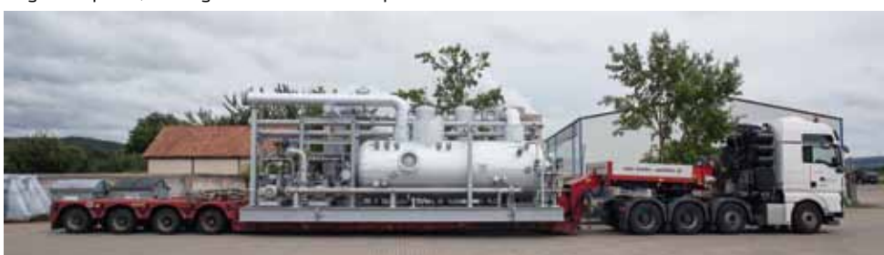
At great expense, the large VMY-unit was transported to its destination.

The seaworthy packed unit is loaded on a container ship near the Mittelland Canal.