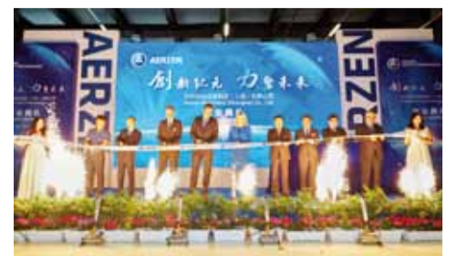
Festive inauguration: With traditional ceremonies, Aerzen China officially opened the new location in Shanghai.