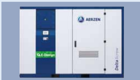
The new models VM 30 and VML 35 complete the E compressors of AERZEN's Delta Screw series.

The planned range of four compressors of the new series Delta Screw E compressor has been extended by AERZEN with two additional sizes now available. The new models VM 30 and VML 35 cover the lower volume flow range of the series and are the perfect addition to the Delta Screw compressor packages with belt drive. This new series of E compressor includes 6 sizes in the volume flow range from 330 m 3 /h to 7,000 m 3 /h and drive capacities from 30 to 400 kilowatts. VM 30 and VML 35 cover a volume flow of 330 m 3 /h to 2,590 m 3 /h and a maximum differential pressure of 2 or 3.5 bar.