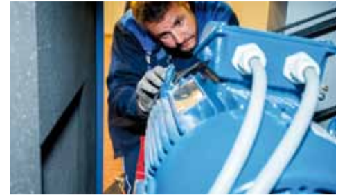
Support during commissioning of Delta Blower E-Design by an AERZEN technician

When designing the new blower, the already known pressure and volume data from the exchanged device could be used - this reduced the expenditure significantly. The modernisation work was limited to the exchange of the devices: - smaller adaptations concerning connection technology and the commissioning were finished in