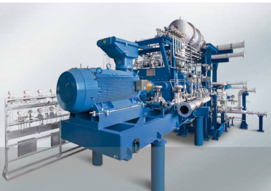
VR series works completely oilfree and offers the possibility of water injection.

Gas compression in the process gas and refrigeration industry requires individual solutions. This is exactly what is developed by AERZEN, together with the plant supplier and operator. This leads to tailor-made products which, are, moreover, robust and energy-efficient, and can have a lifespan in excess of 30 years. ○