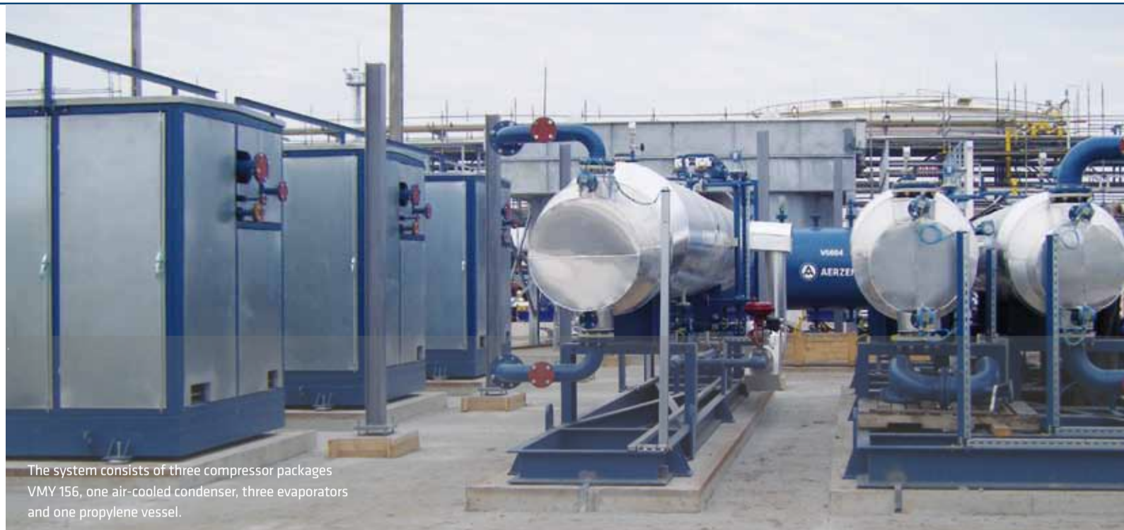
The system consists of three compressor packages VMY 156, one air-cooled condenser, three evaporators and one propylene vessel.