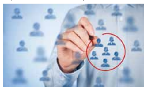
Importance of services which provide total customer satisfaction