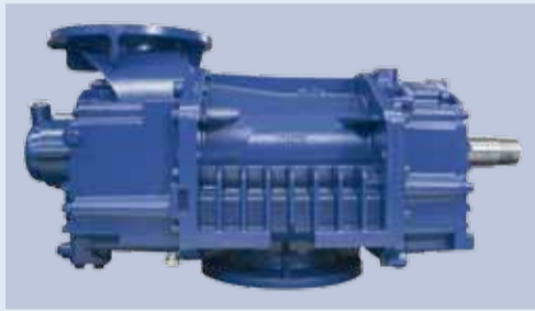
The new "E type" construction extends the successful Delta Hybrid series.

Rotary lobe compressors in the successful Delta Hybrid series are now available in the new "E type" construction for a pressure range of up to -700 mbar. As conventional positive displacement blowers are limited to a maximum differential pressure of -500 mbar, expensive vacuum pumps had to be used for lower pressure ranges. The new E-series remedies this situation, reduces costs and opens up new application possibilities in the field of vacuum conveying - for example in foodstuff technology, plastic granulate pneumatics and in the chemical industry. The advantages for the operator include reduced investment costs, higher energy efficiency and greater flexibility.