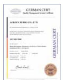
In black and white: Aerzen Turbo was successfully recertified as per ISO 9001.

Aerzen Turbo has again proved its quality standards: in May, the Korean subsidiary successfully passed an audit as per Quality Management Standard ISO 9001. Consequently, this certificate was extended to May 2018. ○