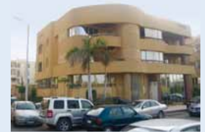
Domicile of the North African subsidiary of AERZEN in Cairo

At present, the team consists of five employees and is responsible for Egypt, Libya, Sudan, Eritrea, Lebanon and Jordan.