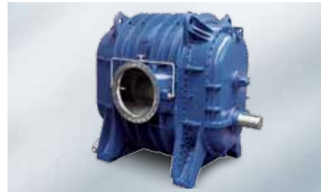
The positive displacement blowers of series GQ are also used in power plants.

AERZEN refrigeration units of series VMY are used in closed cooling circuits and enable a performance adaptation between 20 and 100 percent with their integrated