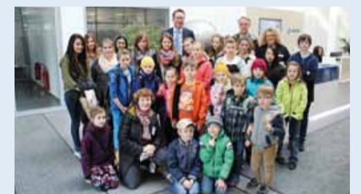
The talented youngsters during their visit at AERZEN