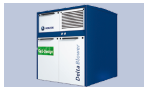
Robust and energy efficient: the new Delta Blower E-Design

ONE"- solution with integrated frequency converter and power panel. The electric blower is available in 6 sizes for intake volume flows from approximately 30 m 3 /h up to 1,000 m 3 /h, for overpressures of up to 1,000 mbar and for negative pressures of up to 500 mbar. Thus, it is the ideal supplement to the innovative AERZEN Rotary Lobe Compressors Delta Hybrid.