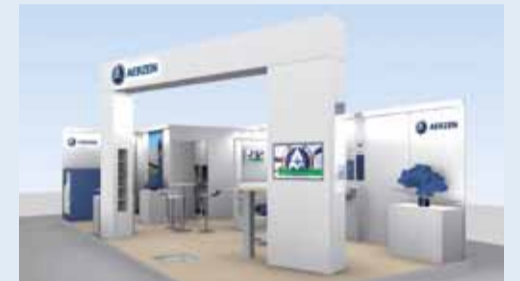
3D model of the new fair stand for the "Maintenance" fair in Dortmund.

AERZEN has developed a new, modular fair stand concept which can easily be adapted to various base areas, and which reflects the new Corporate Identity. The freestanding, portal-like beam construction of this fair stand is designed to attract the attention of visitors from some distance. Therefore, an adequate presentation area is now available for products and services of the AERZEN After Sales Service. We celebrated its debut at this year's "Maintenance" fair from 25-26 February in Dortmund, Germany.