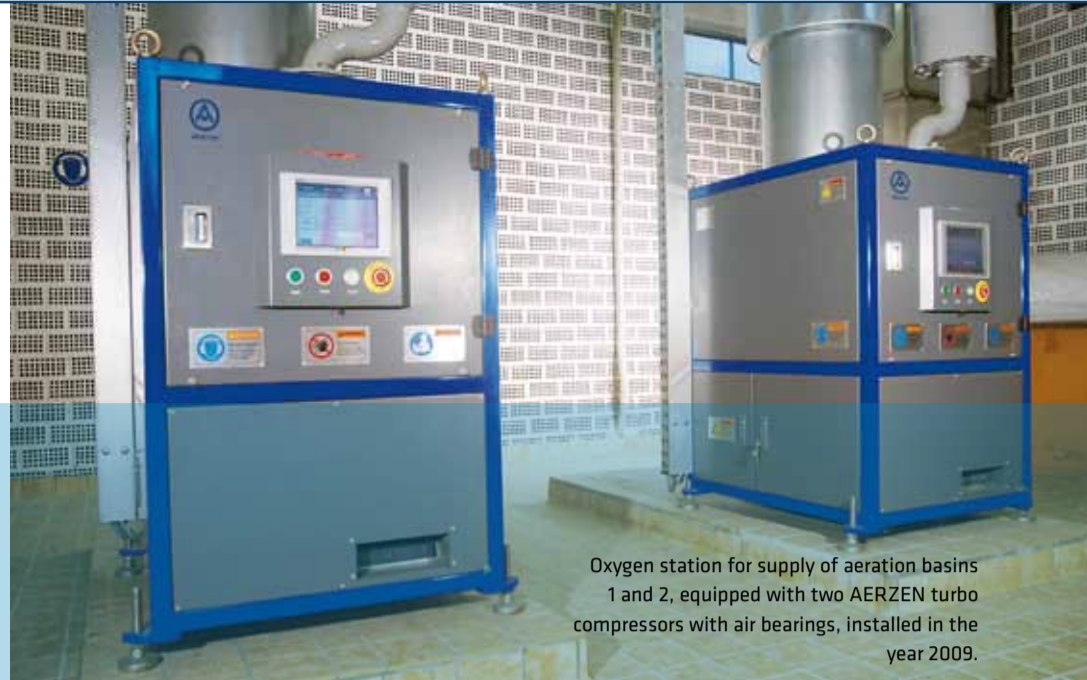
Oxygen station for supply of aeration basins 1 and 2, equipped with two AERZEN turbo compressors with air bearings, installed in the year 2009.

AERZEN provides energy efficient process air generation in the Kötz wastewater treatment plant