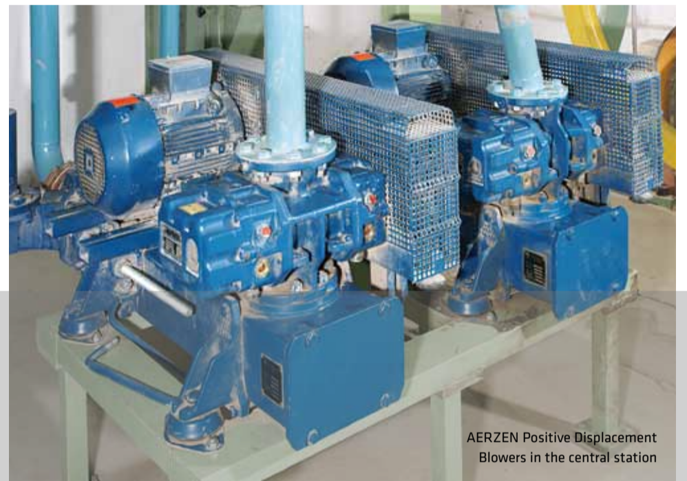
AERZEN Positive Displacement Blowers in the central station

including all standard accessory components for effective operation at the push of a button. They can be used in all climates and will work in the most difficult ambient conditions just as safely as they will in a hall installation - reliably, durably and energy-efficiently. As an option, AERZEN blowers can also be supplied in ATEX-design according to EU-guideline 94/9/EC. This is an increasingly important criterion not only for the food industry, but also for many other branches of industry such as the synthetics industry, environmental technology, the chemical and pharmaceutical industries, in refineries and in power plant technology.