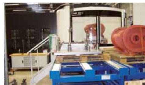
The new CNC turning and milling centre

The new machining centre began operations in January.