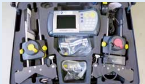
Configured for service application at AERZEN

Machines that are optimally aligned have lower operating and maintenance costs. Thanks to precise alignment, the "Mean Time Between Failure" is reduced and machine availability is increased. For this reason, AERZEN applies across the group the laser-based alignment system OPTALIGN smart RS5 AERZEN. This enables the alignment of directly driven machines. The customer benefits are obvious: lower-wear operation, increased machine availability and prevention of production failures. Using this approach, AERZEN expands its service competence. For any questions, just contact our service managers on site, or our specialists in our parent company.