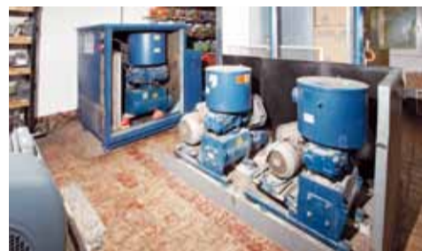
Three AERZEN Positive Displacement Blowers with partly dismantled acoustic hood in an adjacent room

situations, production also takes place on Sunday mornings. Therefore, a reliable and fail-safe supply of conveying air is imperative for Borgstedt. Only then, - can the mill operate on as troublefree basis - an essential requirement for meeting the delivery dates agreed with customers.