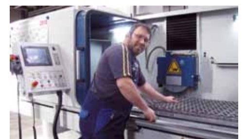
The new flat grinding machine

As a replacement for the FE0178/0179, in November 2014, the new M65 MILLTURN FE 0176 from the manufacturer WFL in Linz, Austria was taken in operation in hall 21. Four identical machines have hitherto been in operation in the production centre for the complete processing of blower