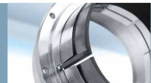
AERZEN Air foil bearings with bump foil