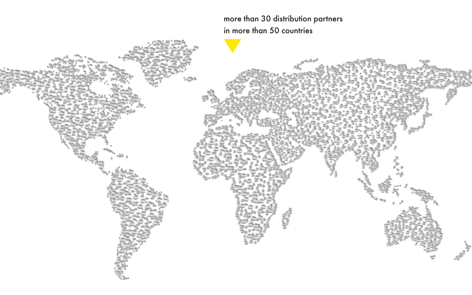
3 as of 2014

AQUACONSULT Anlagenbau G.m.b.H. Badener Strasse 46, 2514 Traiskirchen, Austria Tel. +43 (0)2252 41481 | Fax. +43 (0)2252 41480 sales@aquaconsult.at | www.aquaconsult.at